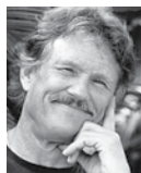
Kris Kristofferson Singer, Songwriter & Actor