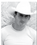
Brad Paisley Country Singer