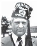
Buzz Aldrin Astronaut

Many famous faces have proudly worn the red fez of the Shriners fraternity. These Nobles include entertainers, heads of government, business leaders and sports legends. A few current Shriners you may have heard of include: