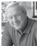
Arnold Palmer Golfer