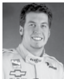
Sam Hornish, Jr. Race Car Driver